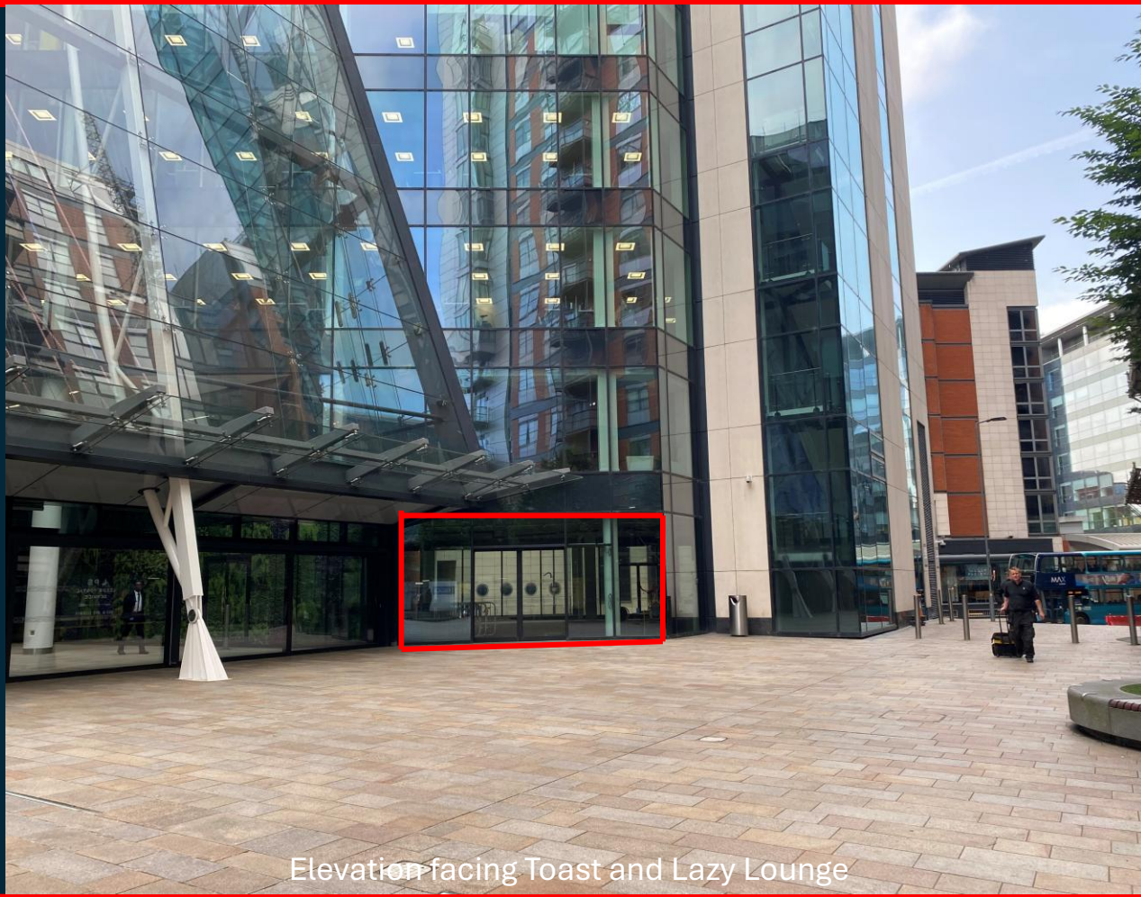
Elevation facing Toast and Lazy Lounge