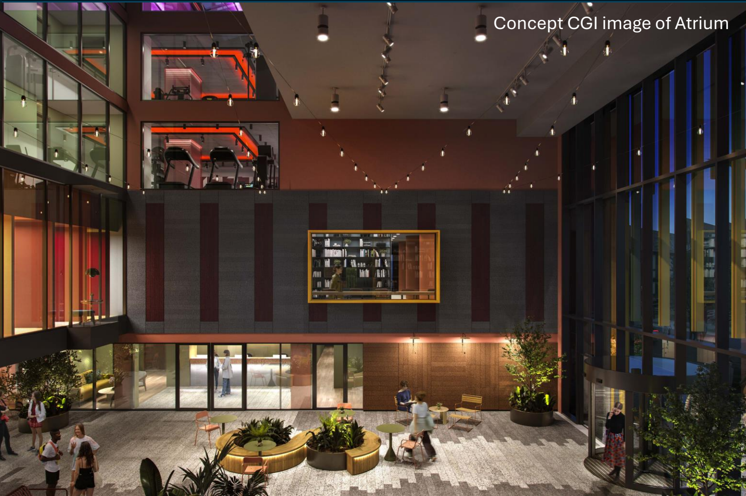
Concept CGI image of Atrium

Scape Development, 44 Merrion Street, Leeds, LS2 8FZ