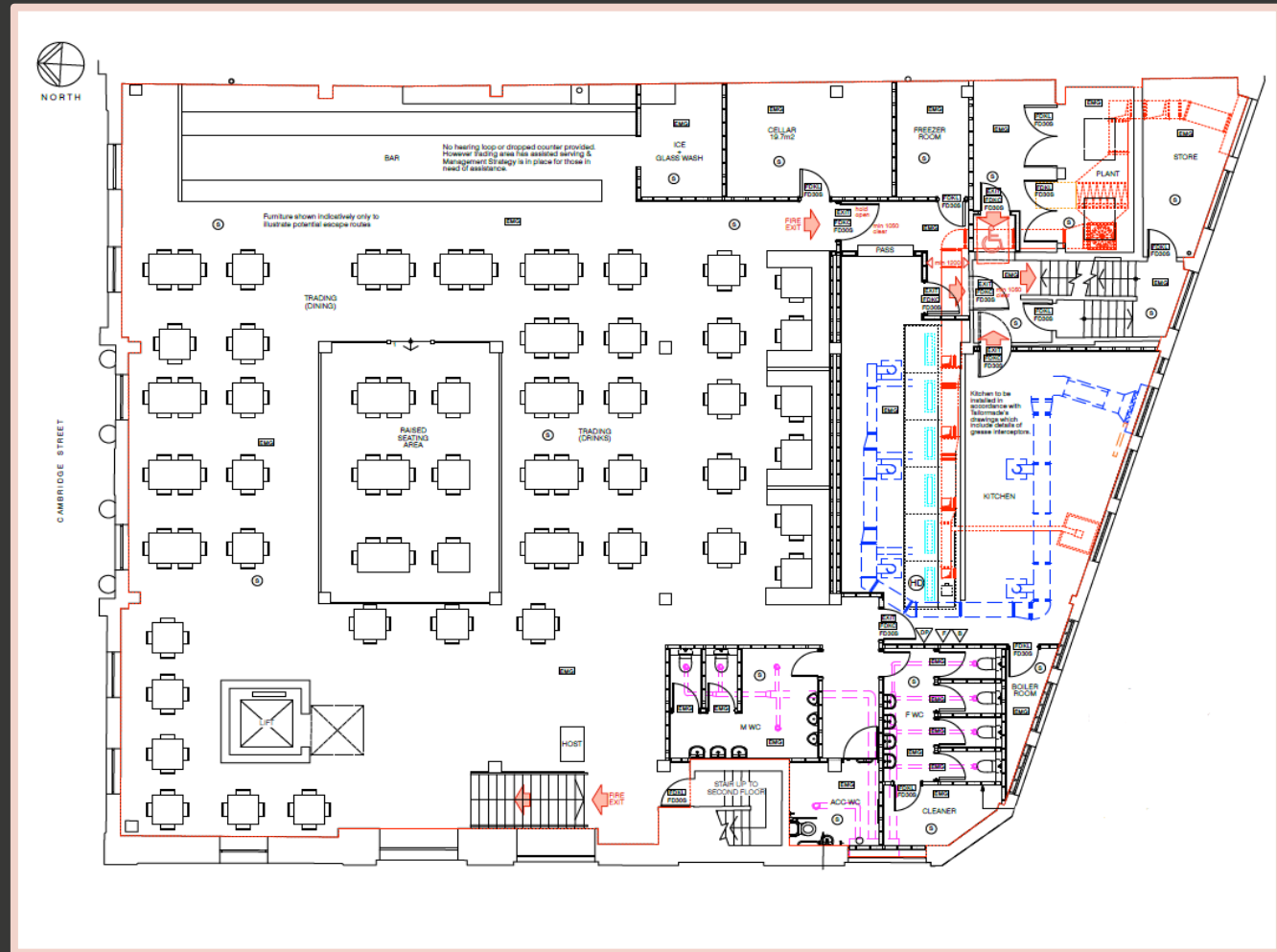
First Floor 568 sqm (6,114 sq ft)