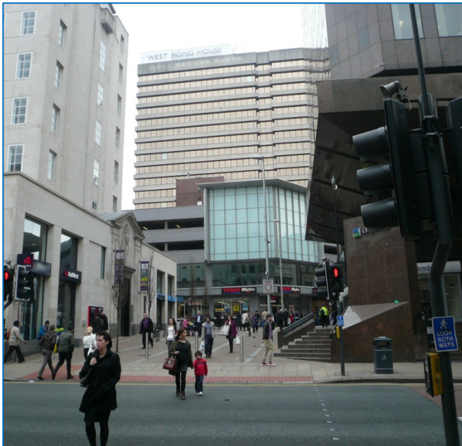
View from Jamie's Italian on Park Row