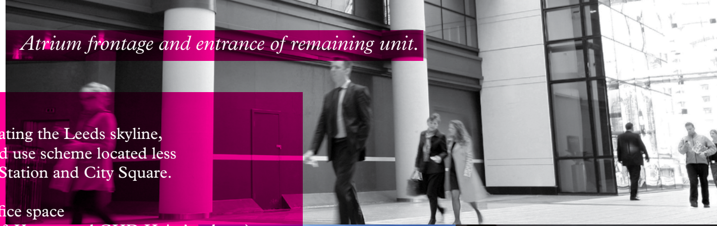
Atrium frontage and entrance of remaining unit.